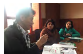
ST. THOMAS INTERNATIONAL