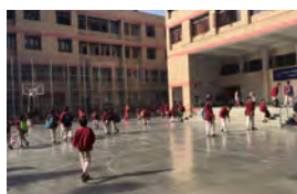
DAV PUBLIC SCHOOL